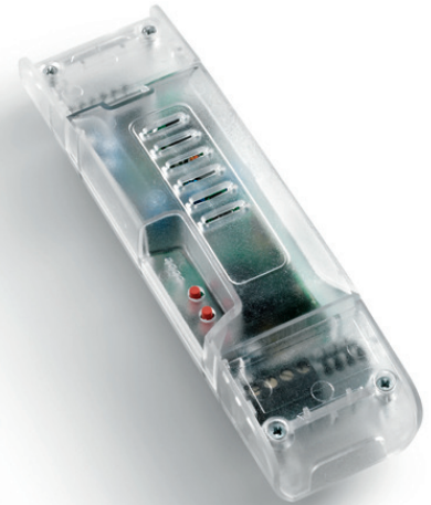
TVRGB916A01 RGB Controller

Create garden highlights by lighting pools, water features, walls, paths, gates, tress and garden beds. Indoors, create atmosphere and mood lighting in a home theatre room, bar room or a feature bathroom or bedroom. Create a dynamic indoor feature wall or a funky party atmosphere at you next BBQ.